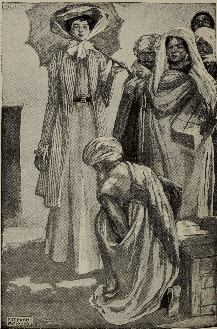
He got laboriously down upon the ground.